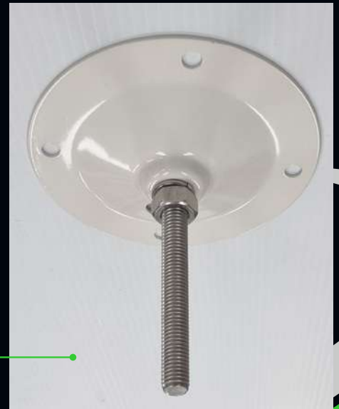
CEILING ROSE MOUNT OPTION